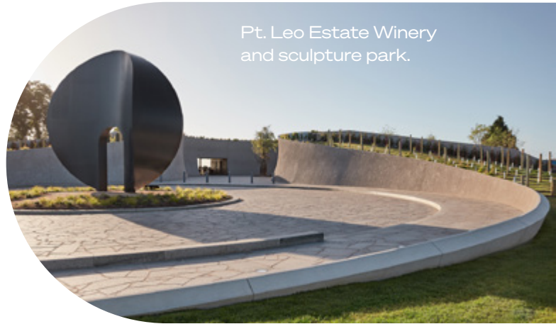
Pt. Leo Estate Winery and sculpture park.

Explore one of the Mornington Peninsula's finest wineries and sculpture park alongside like-minded leaders.